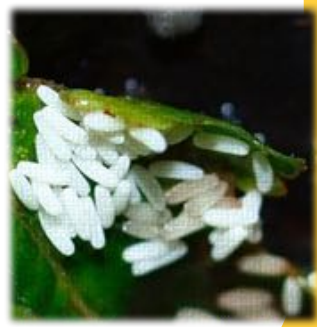
Hoverfly eggs on a lagoon