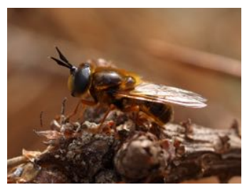
Furry pine hoverfly