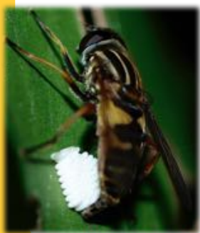
Tiger Hoverfly laying eggs