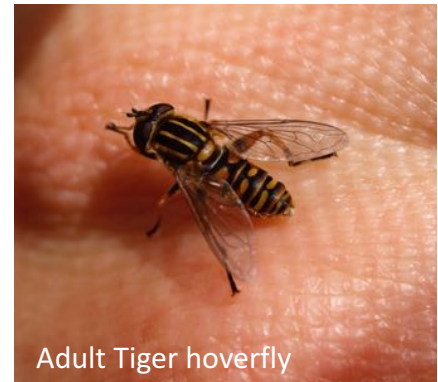
Adult Tiger hoverfly