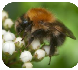
Common Carder bumblebee