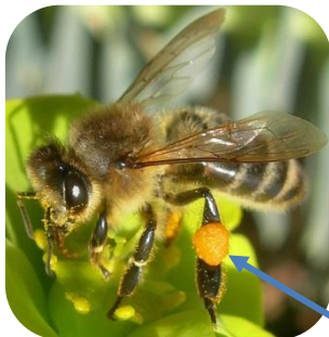
Honeybees- note pollen baskets on hind legs.

There is one species of honeybee in the UK, Smaller and more slender than bumblebees, they are orangey-yellow to brown with dark stripes and have shiny back legs, which are often packed with pollen.